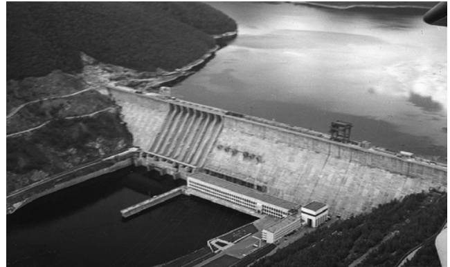
Fig. 3. The Rogun dam for planned hydro power plants of Vakhsh River (under construction), Tajikistan [23]

general increasing (Table II). An additional factor of hydro energetic difficulties in the region is caused by an artificially accelerated development of hydro power energetics in Tajikistan compared to actual water usage, since the country does not have enough oil and gas reserves. Thus, as planned on the governmental level, by 2010, Tajikistan plans to become an energy independent state and start electricity export to Iran, Pakistan and India. For instance, in Tajikistan it is planned to construct 14 hydroelectric power plants on the river Panj, a major tributary of the Amu Darya, and on river Rogun (Fig.3).