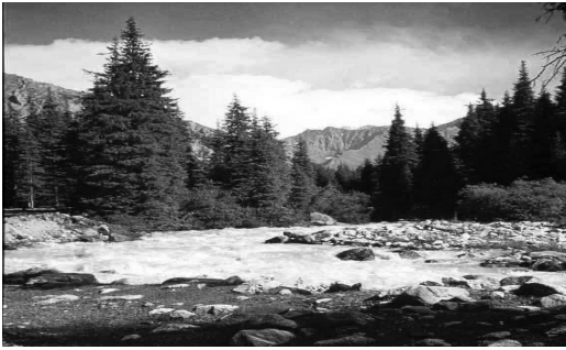
Fig. 2. Typical mountain river in Tian Shan.

ice and snow melt. In winter the Siberian anticyclone prevents much precipitation in this area [3].