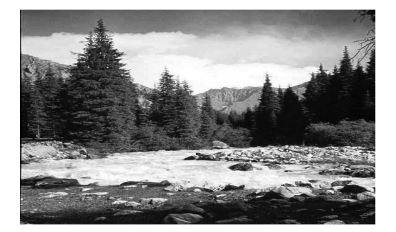
Fig. 2. Typical mountain river in Tian Shan.

ice and snow melt. In winter the Siberian anticyclone prevents much precipitation in this area [3].