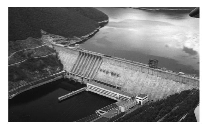
Fig. 3. The Rogun dam for planned hydro power plants of Vakhsh River (under construction), Tajikistan [23]

general increasing (Table II). An additional factor of hydro energetic difficulties in the region is caused by an artificially accelerated development of hydro power energetics in Tajikistan compared to actual water usage, since the country does not have enough oil and gas reserves. Thus, as planned on the governmental level, by 2010, Tajikistan plans to become an energy independent state and start electricity export to Iran, Pakistan and India. For instance, in Tajikistan it is planned to construct 14 hydroelectric power plants on the river Panj, a major tributary of the Amu Darya, and on river Rogun (Fig.3).