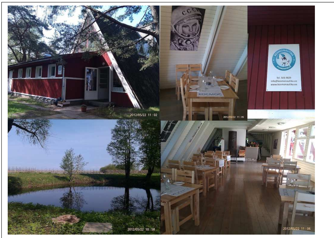
Figure 3. Interior and the surroundings of the Cosmonauts Hotel - a former Soviet summer resort for workers of space industry ( www.kosmonautika.ee ): applying space topic and cosmos theme in hotel: soviet cosmonaut Y.Gagarin who was the guest in this hotel.

The history of Pärnu resort goes back to the XIX century, when Estonia was under protection of Russian Empire. Domestic tourism in the Baltic Provinces including Pärnu, was largely connected with sea bathing during July month. The season always ended by August 1 due to the restricted climatic conditions (Kohl, 1842). During the First World War the development of the resort was largely restricted, though quickly revived after the war. In 1920s the Rannapark has been restored, and a new mud bath constructed, opened for tourists. In late 1920s - 1930s Estonian hotels and restaurants were one of the cheapest touristic destinations in Baltic Europe, which was advertised in the tourist literature of that time. The easy access to the Pärnu region was facilitated by good railway communication with Germany, Latvia, and Lithuania. As a consequence, this region was widely visited by various international guests with the majority of Scandinavians (e.g. Swedes, Finns), Poles, Germans and Brits (Worthington, 2003).