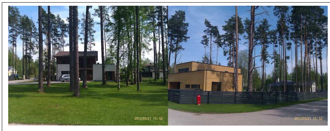
Figure 2. Example of rural environmental tourism: eco-style new cottages built since 1990s in Pärnu surroundings.

In general, Estonian touristic sector currently transforms a gradual functional shift away from authoritative style of tourism with common Soviet guesthouses towards capitalist privately held small hotels. Nowadays, some of former hotels naturally become a bankrupts or else depopulated and lost their tourism function completely. However, as justly recommended by Agarwal (2002), such decline may be avoided in case the counter-measures are accepted and used, such as re-orientation of the hotels towards environmental eco-friendly style, enhancement of the attractions for kids and sightseeings for adults, or even the repositioning of the destination within an overall touristic market.