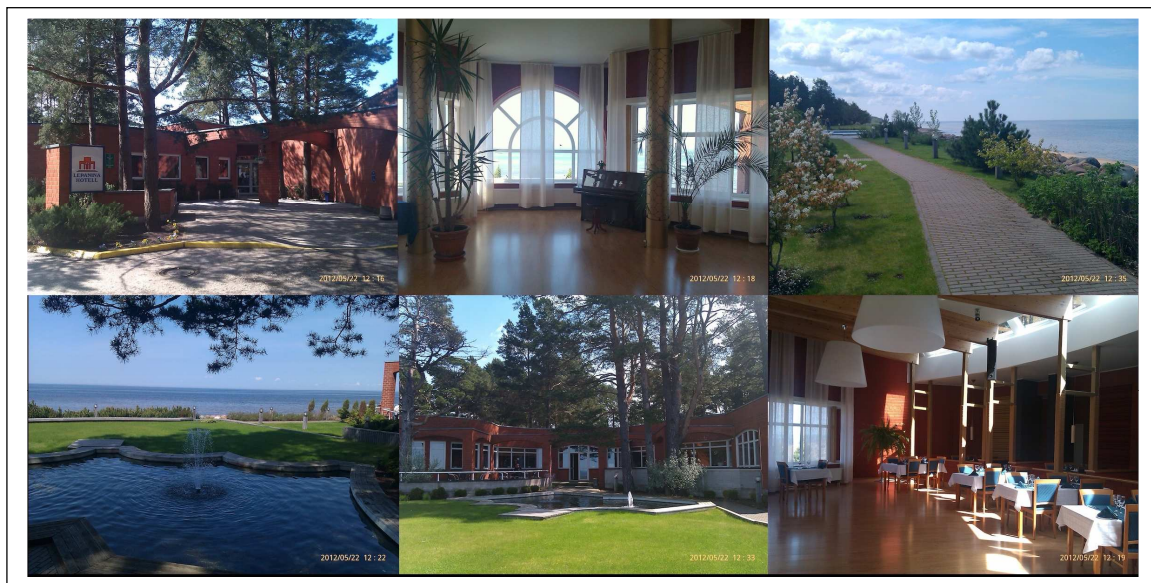
Figure 4. Example of private Estonian spa hotel (Lapanina Hotell) created on the Baltic Sea coast: a successful combination of modern European hotel design, location in the nearest proximity of the sea, maritime design landscapes, and coniferous forests makes it a valuable health resort area.

Currently, Estonia has intensive privatization process, which is caused by serious changes in state regulations on property and ownership. Naturally it caused intensification of construction of privately hold hotels and summer cottages, built both for personal (family based) needs for spending summer vacations, and for rent to incoming tourists, domestic and international. Land management system and urban development of Estonia significantly changed in the past 20 years, which reflects overall socio-economic and political situation in the country (Roose et al. 2012). Nowadays, suburbanization and development of second houses become the major and most evident processes in the current urban dynamics of modern Estonia (Palang and Peil, 2010).