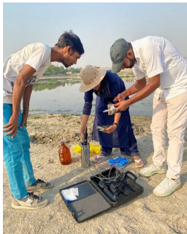
Figure 3: As part of a complex mixture of pharmaceuticals and personal care products (PPCPs), antimicrobial compounds are being released into the environment via many pathways where they can pollute groundwater and surface water bodies. Sampling and testing of wastewater in the field is a first step towards studying the environmental impacts of AMR. Here, students from IIT Roorkee in India studying an artificial lake fed by partially treated wastewater.

of an antibiotic must have an effective environmental management system and that the antibiotic's Predicted No-Effect Concentrations (PNEC), or the level at which a substance will not have an adverse effect on its environment, are met 24 . The PNEC below which AMR is not likely to develop ranges from about 0.1 to 2.0 \mu\text{g L}^{-1} for many antibiotics 9 . For comparison, typical antibiotic concentrations in untreated hospital effluent and industrially polluted surface water can be orders of magnitude higher than PNEC and even can reach the minimal inhibitory concentration (which is the lowest concentration of an antimicrobial drug that prevents the visible growth of a microorganism in a laboratory setting 10 ).