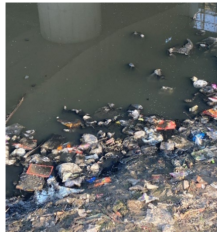
Figure 2: Untreated sewage is discharging in a channel that drains wastewater into the Yamuna River in New Delhi, India. Once released into the surface water, compounds like antimicrobial pharmaceuticals can migrate into the groundwater (T. Boving – URI)