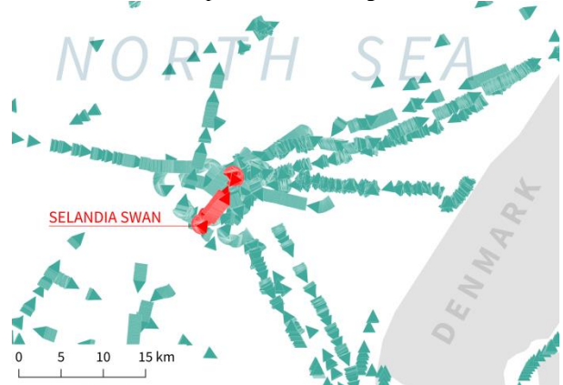
Figure 3: Detected anomalous records during the marine incident of SELANDIA SWAN in 2015. Anomalous records of Selandia Swan (red) and other ships (turquoise) between 10:00 and 14:00 local time. Triangle rotation indicates reported AIS heading.

Figure 3 provides an example of anomalies that were detected in the context of an actual marine accident, a fall over board from SELANDIA SWAN on 23 July 2015 (DMAIB, 2016). The 3rd officer fell overboard between 10:05 and 10:10 local time. Within 15 minutes the crew initiated man overboard procedures. Several ships participated in the search. Our approach correctly detects numerous anomalous records of SELANDIA SWAN (shown in red) as well as other ships (shown in turquoise). The main reasons why these records have been flagged as anomalous are heading (41%), slow speed (25%), and position (14%) due to the unusual patterns observed while the vessels were searching for the missing officer.