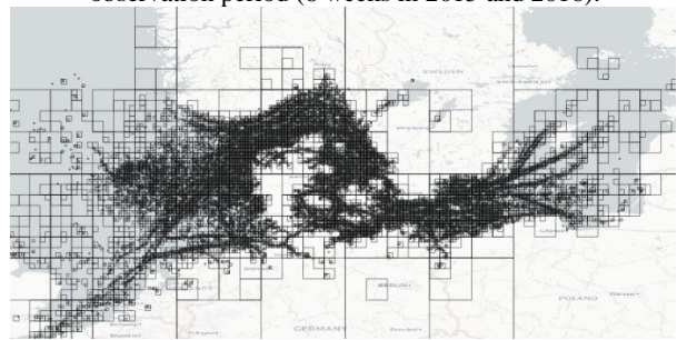
Figure 1: Grid of cells with at least 1,000 records in the observation period (8 weeks in 2015 and 2016).