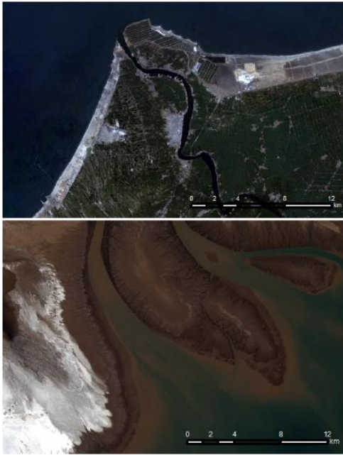
Fig. 3: (a) a natural color Landsat 8 image of the wave-dominated Nile river delta, where a clear distinction between land and water exists (c) a natural color Landsat 8 image of the tide-dominated Colorado river delta. The muddy intertidal flats and sediment plumes surrounding the mouth bars at the river mouth make high-accuracy shoreline extractions challenging.

In addition to the inferences on the robustness of techniques on different types of deltas, as a general guideline, we advocate assigning the sediment plume in the delta nearshore environment to a separate class when conducting Supervised or Unsupervised Classifications. This is especially important in the low-robustness, tide-dominated deltas or low/mid-robustness river dominated deltas with high sediment concentrations. In most cases, when not actively assigned, deltaic land and sediment plume features clustered together, heavily affecting DEA values and erroneous extractions.