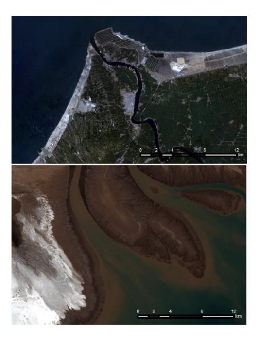
Fig. 3: (a) a natural color Landsat 8 image of the wave-dominated Nile river delta, where a clear distinction between land and water exists (c) a natural color Landsat 8 image of the tide-dominated Colorado river delta. The muddy intertidal flats and sediment plumes surrounding the mouth bars at the river mouth make high-accuracy shoreline extractions challenging.

In addition to the inferences on the robustness of techniques on different types of deltas, as a general guideline, we advocate assigning the sediment plume in the delta nearshore environment to a separate class when conducting Supervised or Unsupervised Classifications. This is especially important in the low-robustness, tide-dominated deltas or low/mid-robustness river dominated deltas with high sediment concentrations. In most cases, when not actively assigned, deltaic land and sediment plume features clustered together, heavily affecting DEA values and erroneous extractions.