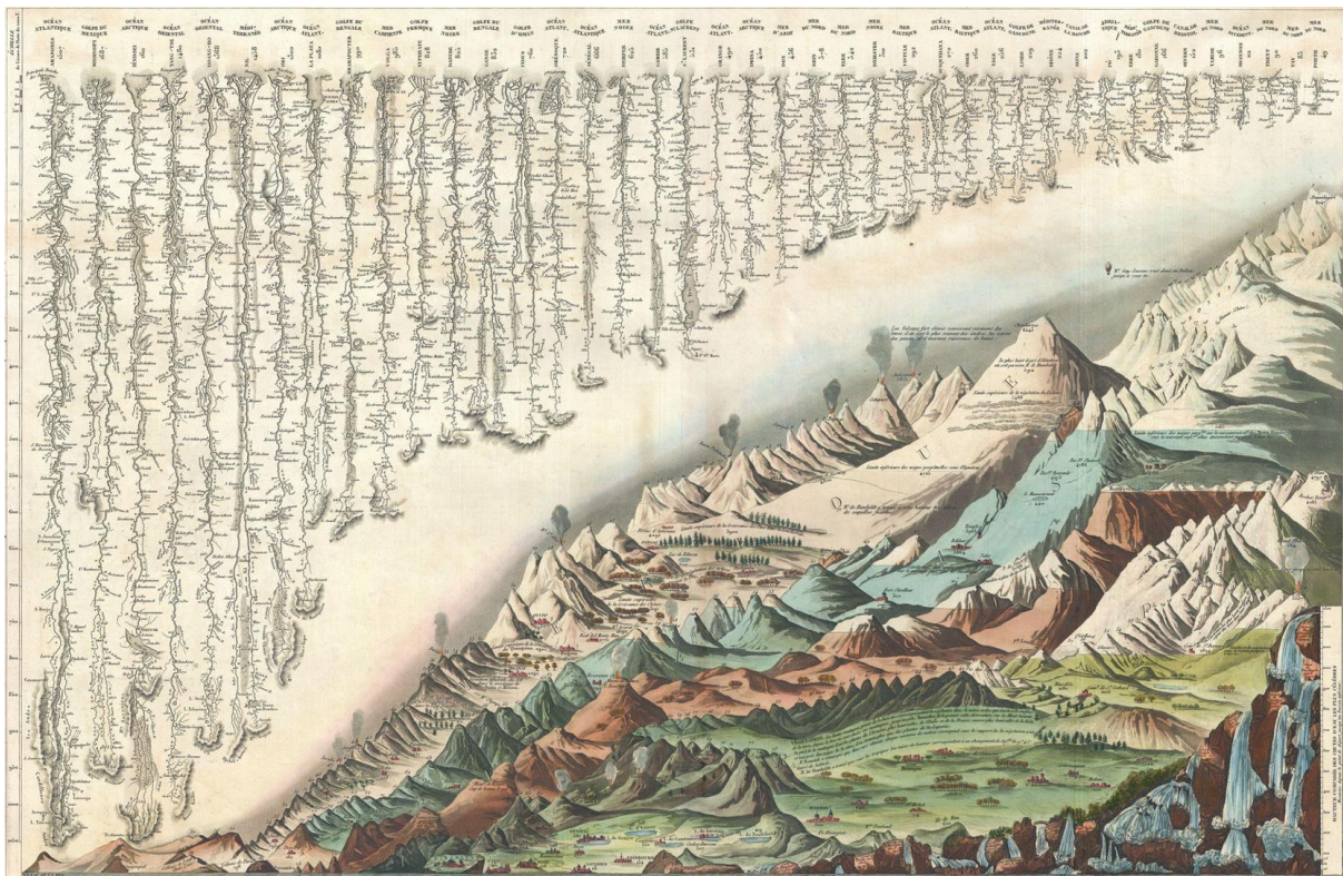
Figure 2. Tableau Comparatif et figuré: a systematic ordering by elevation of the highest mountains of the world and by length of the largest rivers of the world drawn up by geographers J. Goujon and J. Andriveau in Paris in 1836. 63 The mountains are numbered and their names, heights (in toises and in meters), mountain range and country listed by continent in tables next to the map. Many such maps were drawn in the early 19 th century with length or elevation as the ordering principle.