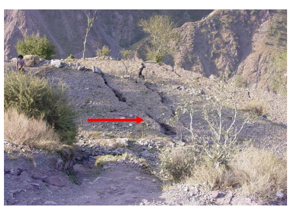
Rock Fracturing on Balakot-Kaghan roadside