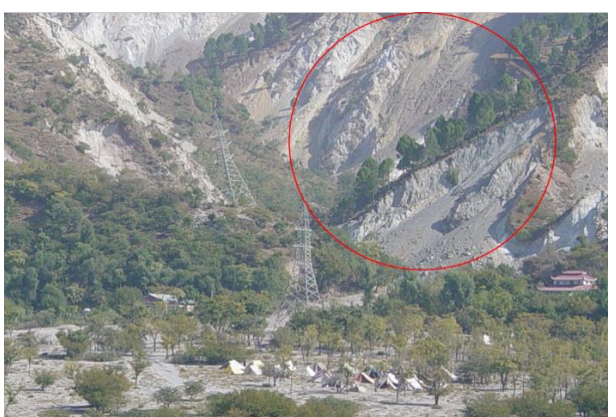
Rock sliding along a fault zone in Balakot area