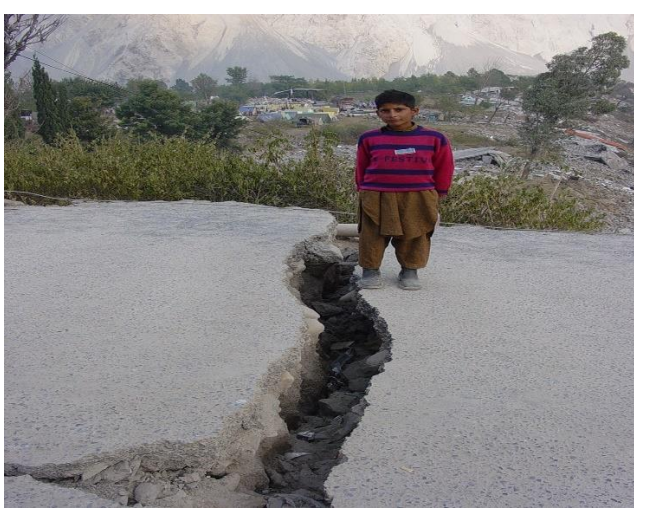
Rupture zone passing through Nisar Camp and the road site