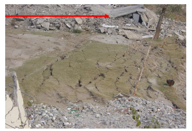
Destroyed Nisar Camp near Muzaffarabad close to rupturing zone