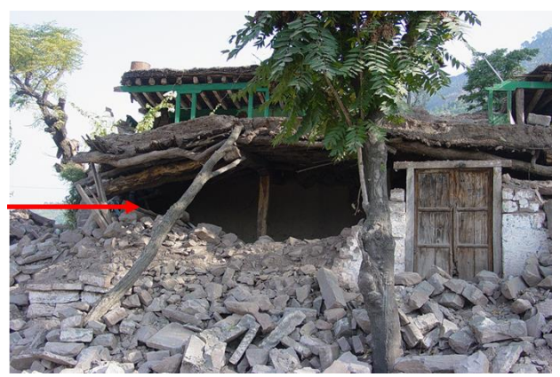
The lightweight wooden house proved earthquake-resistant compared to that constructed with blocks and improper shaped rock pieces-Dhirkot