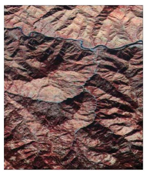
(a) November 14, 2000 (ASTER, VNIR (15 m)), (Avouac et al. 2006)