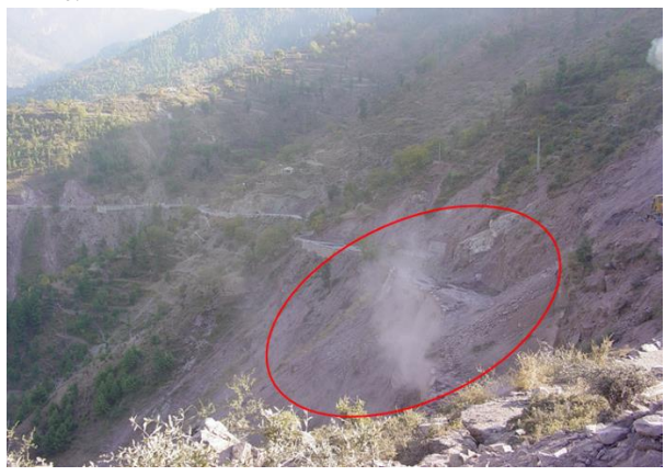
Fracturing and shaking caused major slides along the Kaghan road