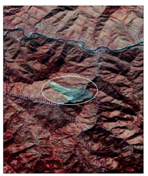
(b) October 27, 2005 (ASTER, VNIR (15 m)) (Avouac et al. 2006)