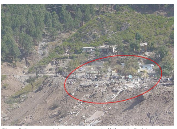
Slope failure caused damage to many buildings in Balakot