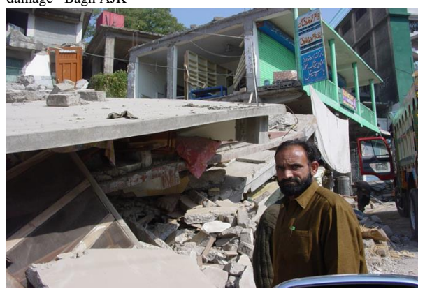
Collapsed improper concrete buildings in the foreground and light wooden structures in the background