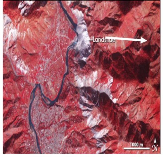
October 27, 2005 (ASTER, VNIR (15 m))