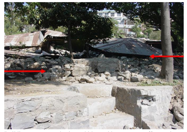
Buildings constructed using cobbles and lean mortar suffer maximum damage –Bagh AJK