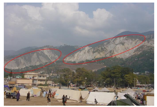
Active fault zone passing north of Muzaffarabad city