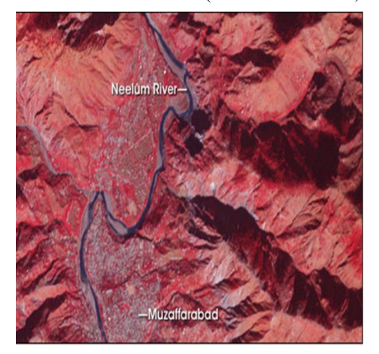
November 14, 2000 (ASTER, VNIR (15 m))