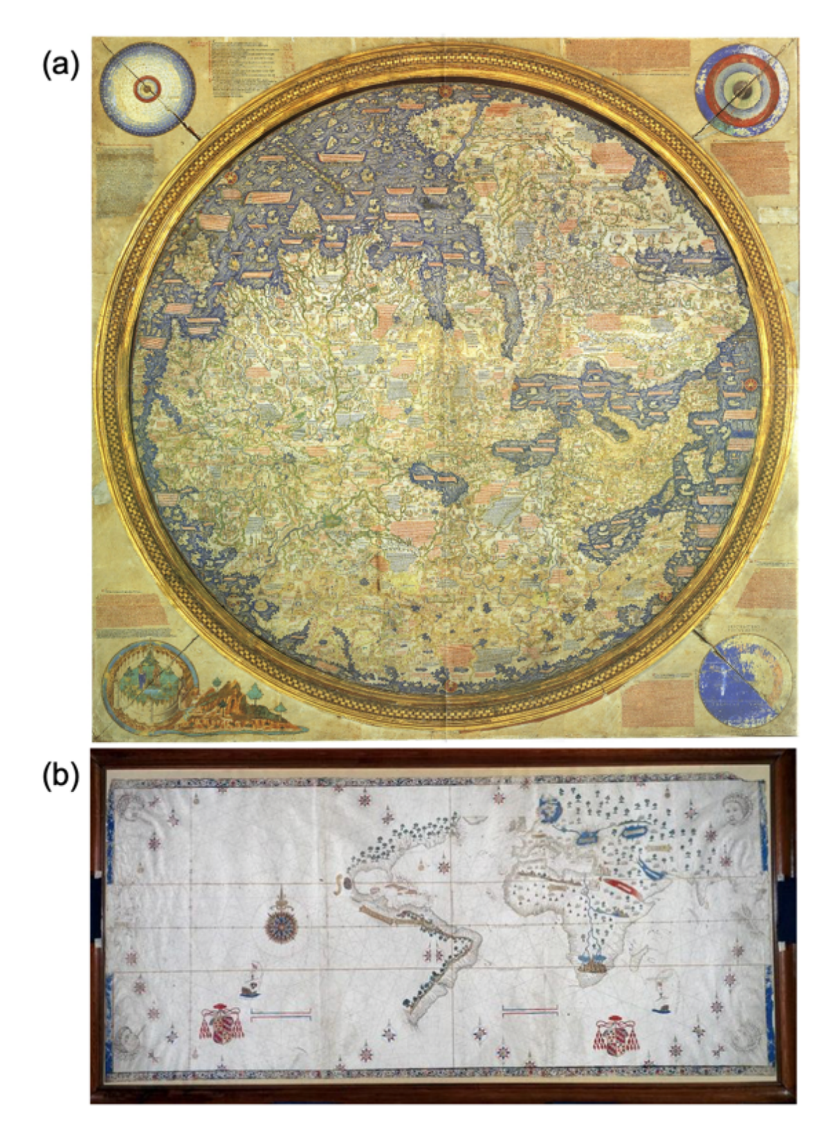
Figure 1. (a) The Fra Mauro world map from 1459 shows seemingly complete knowledge of the world. However, on closer inspection, maps like this one included statements like HIC SUNT LEONES and images of monsters in unexplored regions. (b) The Salviati Planisphere is a world map from 1525 without imagined representations, highlighting knowledge gaps.