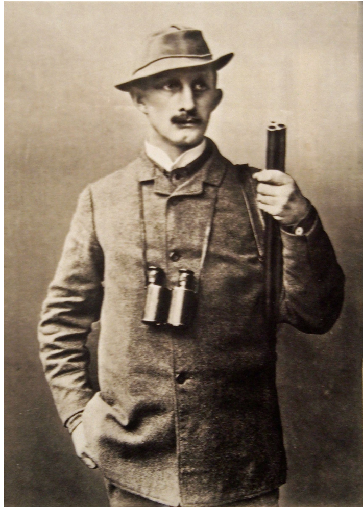
FIGURE 1: Hermann Löns (1866-1914). Photography taken around 1900, in Public Domain.