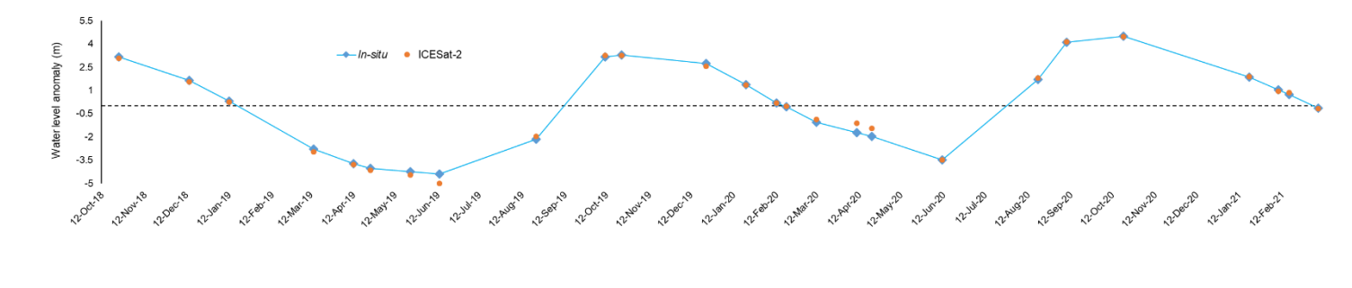
Figure 2 Water level anomaly time series