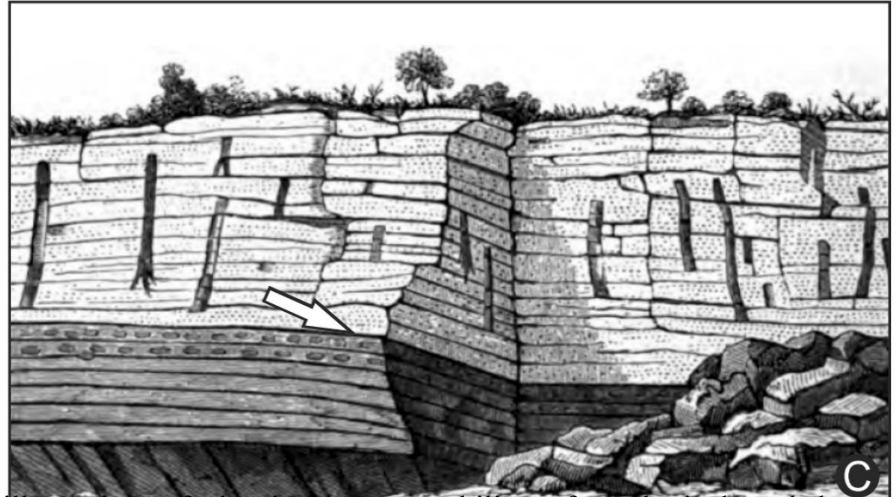
Figure 2 . An intustration of the incommensurability of geological and human time scales: Pennsylvanian trees buried in position of growth. These "polystrate" fossils document rapid sediment accumulation at the scale of days to years that cannot be maintained through any geologically significant length of time, and thus must be compensated by long periods of non deposition concealed in a series of subtle discontinuities such as those indicated by arrows. A ) Nant Lech, Swansea Valley, South Wales (fig.4.5 in Ager 1993); B ) Joggins, Nova Scotia (fig.35 in Dawson, 1868); C ) St. Étienne, France (fig.310 in Credner, 1906).