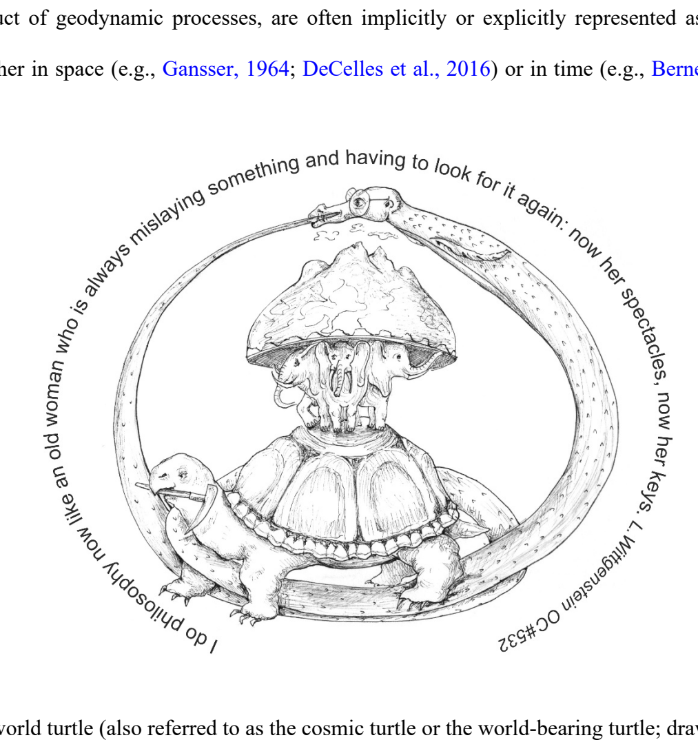
Figure 4 . The world turtle (also referred to as the cosmic turtle or the world-bearing turtle; drawing by Laura Medina) is a mytheme of a giant turtle (or tortoise) supporting or containing the world. The mytheme, which is similar as that of the world elephant and world serpent, occurs in Hindu mythology, Chinese mythology and the mythologies of the indigenous peoples of the Americas (after Wikipedia).

The steady state is a paradoxical stratagem used to isolate a physical portion of Nature from a continuum constantly subject to change in space and time. In this way we create a functional laboratory with simple and well-defined initial conditions (Paola, 2011). As the sphericitization of the cow, this operation disrespects the origin and character of geological features and processes, which are invariably influenced by pre-existing lithologies, structures, and events that change both in time and from place to place. This makes each natural object distinct and unique, and therefore unmodellable (" there can be no general theory, only the effects of competing causes "; Leeder, 2011). If we need to move on, then we must find expedients, and simplify. For instance, collisional orogenic belts, representing the most complex product of geodynamic processes, are often implicitly or explicitly represented as quasi-cylindrical, either in space (e.g., Gansser, 1964; DeCelles et al., 2016) or in time (e.g., Bernet et al., 2001).