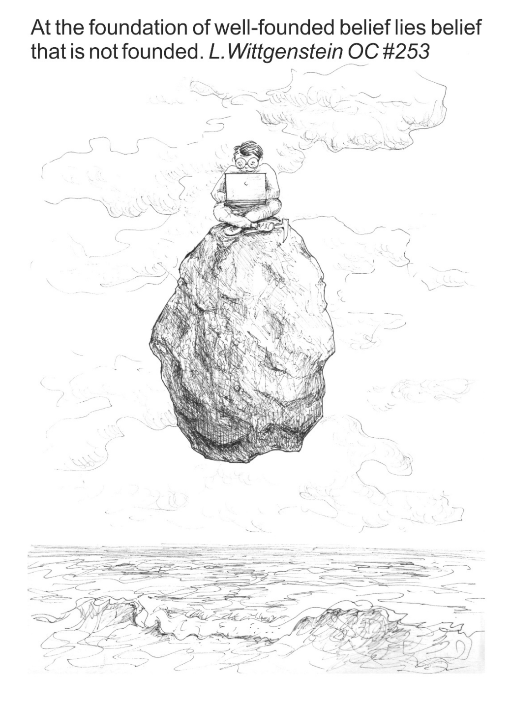
Figure 3 . Human knowledge, geological knowledge being no exception, is based on assumptions that have no firm base (from Magritte, 1959, redrawn by Laura Medina). While modelling natural phenomena, the risk is to interpret the results as facts and not as a derivation of the assumed premises.

do: endeavour in the heretic task to penetrate Nature, which is absolute, with our subjective concepts and limited intellectual and material means. How then to proceed?