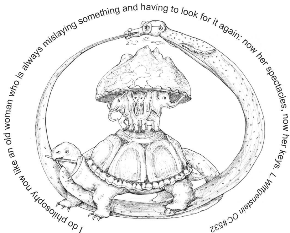
Figure 4. The world turtle (also referred to as the cosmic turtle or the world-bearing turtle; drawing by Laura Medina) is a mytheme of a giant turtle (or tortoise) supporting or containing the world. The mytheme, which is similar as that of the world elephant and world serpent, occurs in Hindu mythology, Chinese mythology and the mythologies of the indigenous peoples of the Americas (after Wikipedia).

The steady state is a paradoxical stratagem used to isolate a physical portion of Nature from a continuum constantly subject to change in space and time. In this way we create a functional laboratory with simple and well-defined initial conditions (Paola, 2011). As the sphericization of the cow, this operation disrespects the origin and character of geological features and processes, which are invariably influenced by pre-existing lithologies, structures, and events that change both in time and from place to place. This makes each natural object distinct and unique, and therefore unmodellable (" there can be no general theory, only the effects of competing causes "; Leeder, 2011). If we need to move on, then we must find expedients, and simplify. For instance, collisional orogenic belts, representing the most complex product of geodynamic processes, are often implicitly or explicitly represented as quasi-cylindrical, either in space (e.g., Gansser, 1964; DeCelles et al., 2016) or in time (e.g., Bernet et al., 2001).