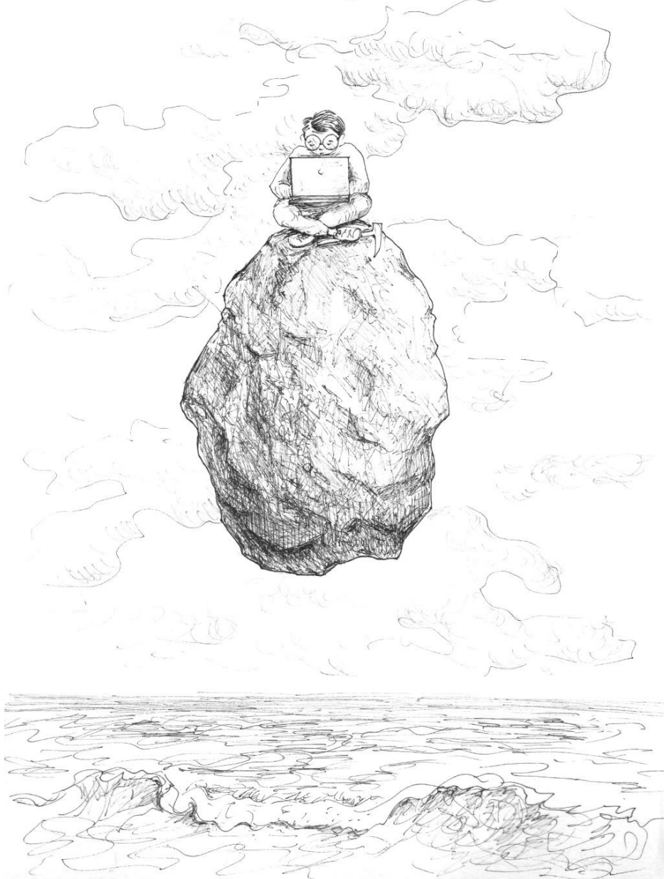
Figure 3. Human knowledge, geological knowledge being no exception, is based on assumptions that have no firm base (from Magritte, 1959 , redrawn by Laura Medina). While modelling natural phenomena, the risk is to interpret the results as facts and not as a derivation of the assumed premises.

At the foundation of well-founded belief lies belief that is not founded. L. Wittgenstein OC #253