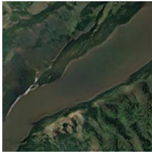
Fig. 3. 1 River Image (256x256 resolution). The river can clearly be seen running through the center of the image, and the PGGAN has done a good job of capturing the green detail present in the surrounding landscape. Additionally, there is no sign of any failure to figure out the color space of the image; even with thousands of images of rivers with a green background, the GAN is able to understand that this specific image should not have a green background, and therefore is able to adapt to the different styles present in the original training dataset.