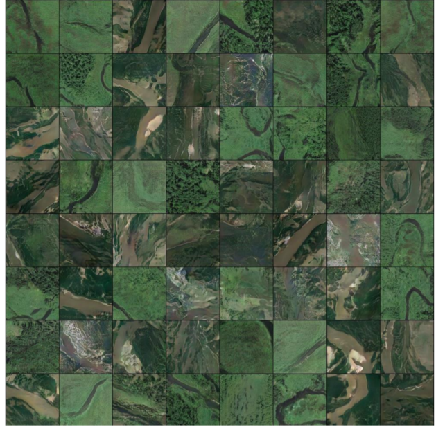
Fig. 2. Set of 256x256 GAN-Generated Satellite River Imagery. Across these 64 images, the final results show highly realistic river satellite imagery with little to no flaws in image quality. Specifically, this set of images was generated by the last checkpoint (iteration #96,000 for the 256x256 generation block of the PGGAN).

Figure 4 shows 64 samples of DCGAN synthesized satellite imagery, trained on a convolutional GAN for 50 epochs with a standard learning rate of 0.001, and Adam optimizers for both