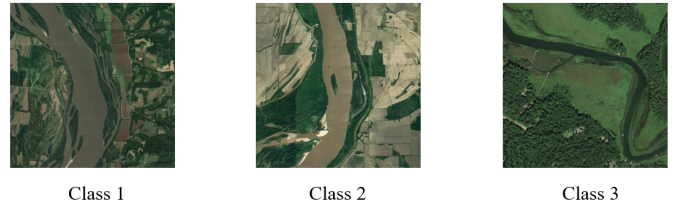
Fig. 5. These seem to be the qualitatively differentiated classes present in the original dataset of 10,130 satellite river images. They all have different colored backgrounds comprising different kinds of greenery and bushes, and the rivers themselves each have a different color.

Our inception value for the river image dataset was approximately 2.80548. With approximately 3 main classes present in our data, we can conclude that our PGGAN implementation for synthesizing custom river satellite imagery is quite efficient and accurate.