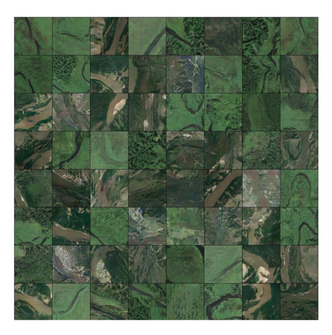
Fig. 2. Set of 256x256 GAN-Generated Satellite River Imagery. Across these 64 images, the final results show highly realistic river satellite imagery with little to no flaws in image quality. Specifically, this set of images was generated by the last checkpoint (iteration #96,000 for the 256x256 generation block of the PGGAN).

Figure 4 shows 64 samples of DCGAN synthesized satellite imagery, trained on a convolutional GAN for 50 epochs with a standard learning rate of 0.001, and Adam optimizers for both