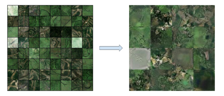
Fig. 4. The left side shows a sample of 64 DCGAN generated satellite images, of 64x64 resolution. The right side shows samples of DCGAN-generated images at 256x256 resolution; because of the DCGAN's inaccurate results on higher resolutions, we use the PGGAN network.

the generator and discriminator networks. Although the rivers seem to be highly accurate and without many imperfections, the images are of a very small size. Even with upsampling techniques like bilinear or cubic interpolation, the images will not be on par with a PGGAN-generated high-resolution sample. The image to the right shows our results when training a modified DCGAN with extra layers to produce 256x256 images. Even after 50 epochs, there are no signs of rivers forming in any of the images. This, compared with the results from our PGGAN implementation, further reinforces the benefits we found when generating high-resolution satellite imagery.