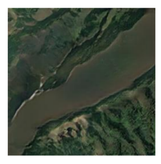
Fig. 3. 1 River Image (256x256 resolution). The river can clearly be seen running through the center of the image, and the PGGAN has done a good job of capturing the green detail present in the surrounding landscape. Additionally, there is no sign of any failure to figure out the color space of the image; even with thousands of images of rivers with a green background, the GAN is able to understand that this specific image should not have a green background, and therefore is able to adapt to the different styles present in the original training dataset.