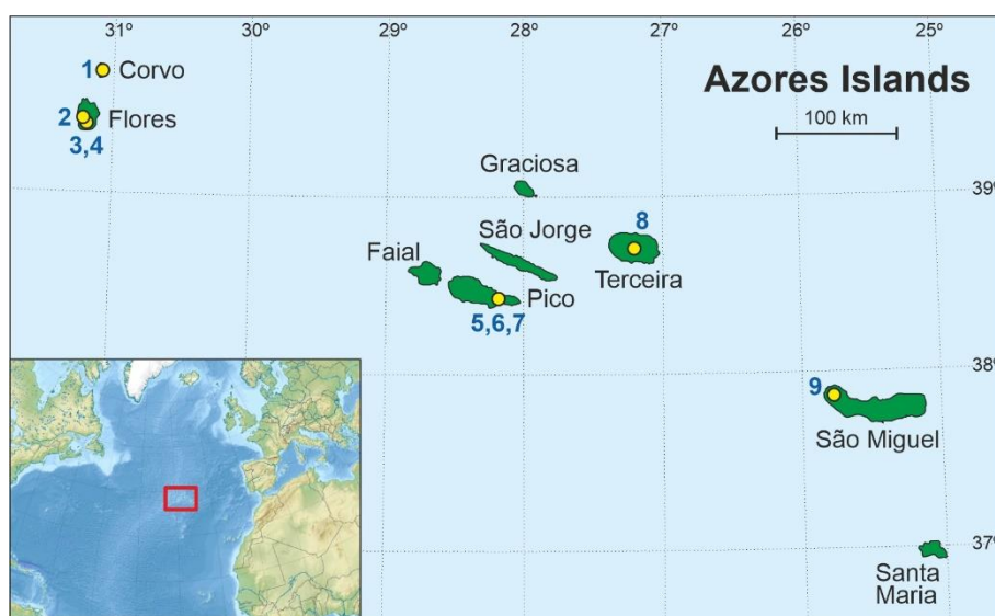
Figure 1. Map of the Azores Islands indicating the sites with paleoecological records discussed in the text (yellow dots). 1, Caldeirão; 2, Alagoinha; 3, Rasa; 4, Funda; 5, Caveiro; 6, Peixinho; 7, Pico; 8, Ginjal; 9, Azul. Coring localities after Connor et al. (2012, 2013); Rull et al. (2017a) and Raposeiro et al. (2021).

The landscape of the Azores Islands (Fig. 1) is one of the most deeply transformed among oceanic islands, as most of their original forests have been replaced by other vegetation types introduced from elsewhere (Schaeffer, 2003). This has been considered a large-scale unintentional ecological and biogeographical experiment on the assembly of island biotas and ecosystems (Rull, 2021). These transformations are known to have been caused by the Portuguese colonizers who occupied the archipelago in the mid-15 th century (Dias, 2007), but whether they were the first settlers and the main anthropization agents is currently under debate.