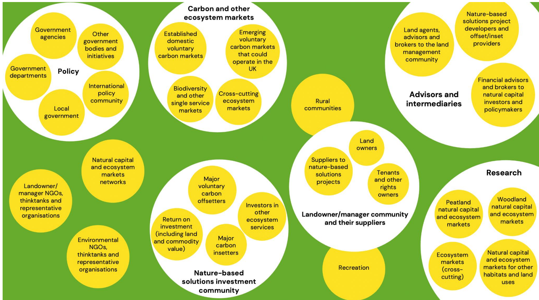
Figure 2: Market actors with interests in the development of high-integrity ecosystem markets.