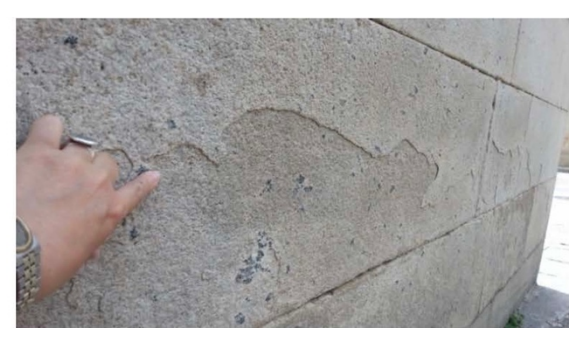
Figure 3. Left: Slab of Martinamor granite in the historical quarry. Right: Martinamor granite in the basal part of a historic building of Salamanca. Scaling in granite is common but does not affect its integrity. Explanation in Pereira 2019.