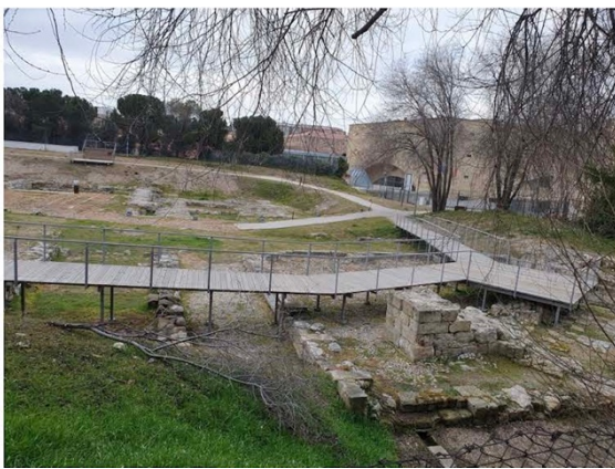
Figure 8. Remains of a convent and two university residences, which were demolished by Napoleon's troops.

The convent of San Agustín was the home of the most important professors of the University of Salamanca in the 13th century. During the 16th century, important buildings were built for the students of the time. This area was once a Jewish neighborhood, with a very rich cultural heritage. The convent was built in Romanesque style and gave rise to the convent that was destroyed by the French in the 19th century. The building was used by the French army as barracks and in 1812 it was demolished to use the stone for the construction of defensive infrastructures. In the 1980s the area was covered and converted into athletic running tracks. After many years of neglect as a cultural site, in 2022 the local government adapted it to be visited, and included it in a visiting tour, along with Cerro San Vicente and other sites that explain the evolution of the city of Salamanca, including its role during the French War of Independence in 1812. Impressive projectile impacts can still be seen in other buildings and monuments in the province of Salamanca, such as the cathedral of Ciudad Rodrigo, a town in the province of Salamanca on the border between Spain and Portugal, where the fighting between the French army and the British and Portuguese armies was crucial to the victory of the British (Figure 9).