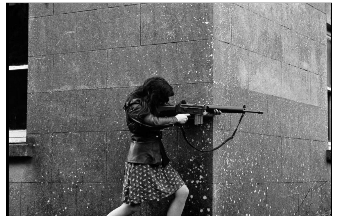
Figure 11. A woman IRA volunteer on active service in West Belfast with an AR18 assault rifle.