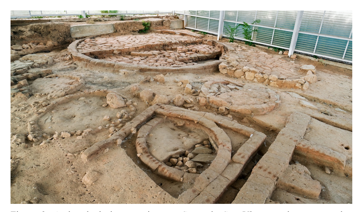
Figure 2. Archaeological excavations at Cerro de San Vicente, where a complex settlement structure was the origin of the city of Salamanca.

Salamanca is a very particular place: the scene of wars and stone-built heritage that remains to tell stories. Like all Spanish areas, it was the subject of numerous military actions over the centuries. Spain had different governments over the years, including forty