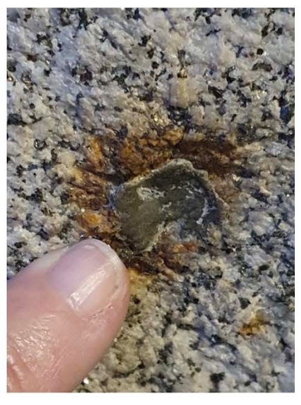
Figure 5. Dark spots in granite, due to small iron-rich enclaves, which were interpreted as marks left by the shooting. Even if the explanation is not true, history allows us to recall a very tragic event at the beginning of the war. Right: Detail of one of the dark spots.

However, long before the Spanish Civil War, Spain suffered an invasion by Napoleon troupes. Napoleon, the French emperor, wanted to take over the world and started fighting everywhere, invading as many countries as he thought possible. Some of the battles took place in Salamanca, the city and the province. In fact, the Battle of Arapiles was the beginning of the end of the French invasion, as the English and Portuguese armies, with some help from the Spanish, defeated the invaders Pérez-Ruiz (2021). Arapiles means hills, and each army used one to defend the strategic point. Arapiles is located 5 kilometers south of the city of Salamanca, where there are two inselbergs (Figure 6, left) made of the opal-cemented conglomerate, and now it is also connected to a historic site in the province. This was a strategic location where a big battle took place in 1812 during the Spanish War of Independence (1808–14). It was there that Wellington, in command of the Anglo-Portuguese army and helped by some Spaniards, defeated Napoleon's troops. As a result, these quarries are perfectly preserved, not because of the importance of the stone, but because of their historical relevance. The site is an attraction, mainly for