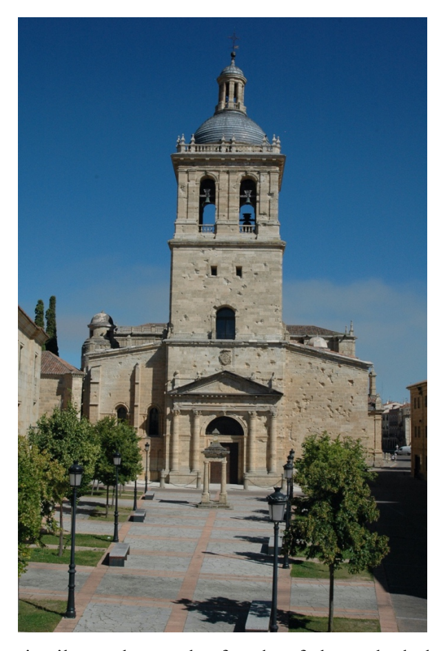
Figure 9. French projectile marks on the façade of the cathedral of Ciudad Rodrigo (Salamanca). The construction of this cathedral began in the 12th century and was completed in the 14th century, in Romanesque style in transition to Gothic.

Another interesting example linking the stone to violent actions can be seen in the center of Belfast. During the years between the 1960s and the 2000s, Europe experienced numerous nationalist conflicts. The so-called Irish Troubles took place in Northern Ireland but also affected different parts of the Republic of Ireland, England, and Europe (Keefe 2019). While terrorist group ETA targeted specific individuals and the homes and offices of the Civil Guard in Spain, the Troubles focused their violent actions on the streets. Much has been written about the Irish Troubles, but in a nutshell, the Troubles consisted of the clash of Protestants, or Loyalists, who wanted Northern Ireland to remain within the United Kingdom, and Catholics, or Irish nationalists and republicans, who wanted to create a united Ireland (Keefe 2019). The consequences of the Troubles can be imagined by visiting Northern Ireland, where the bombings devastated entire buildings, leaving a painful scar on the streets, and where paintings of the leaders of both sides cover