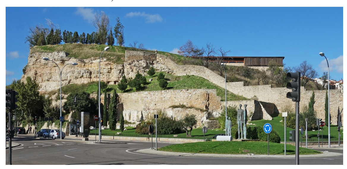
Figure 1. Cerro de San Vicente. A hill of opal-cemented conglomerate, the origin of the city and today's southern entrance to the city.

to defend the location that would become their permanent dwellings (Figure 2) (Pereira 2019 and references therein).