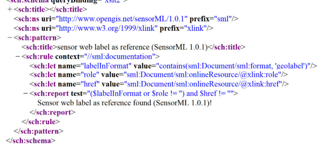
Figure 4: A screenshot of a SensorML 1.0.1 snippet displayed with Firefox browser. A reference to a label is provided as an online resource with format string and xlink:role attribute signalling the document is an SWL.

Figure 3: A Schematron document with a rule reporting inline SWL in SensorML 1.0.1, displayed with Firefox browser. <sch:schema queryBinding="xslt2"