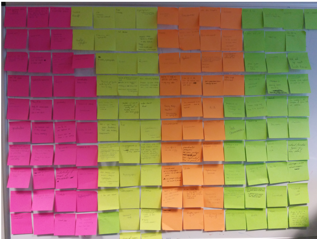
Figure 1. Example of informal feedback gathered with post-it notes from the students of 2016-17.