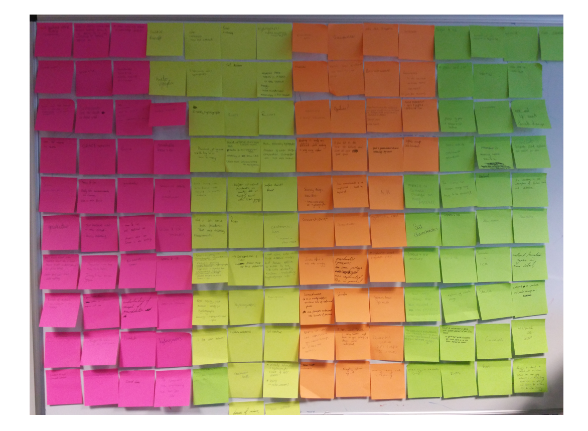
Figure 1. Example of informal feedback gathered with post-it notes from the students of 2016-17.